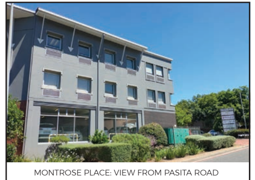
MONTROSE PLACE: VIEW FROM PASITA ROAD