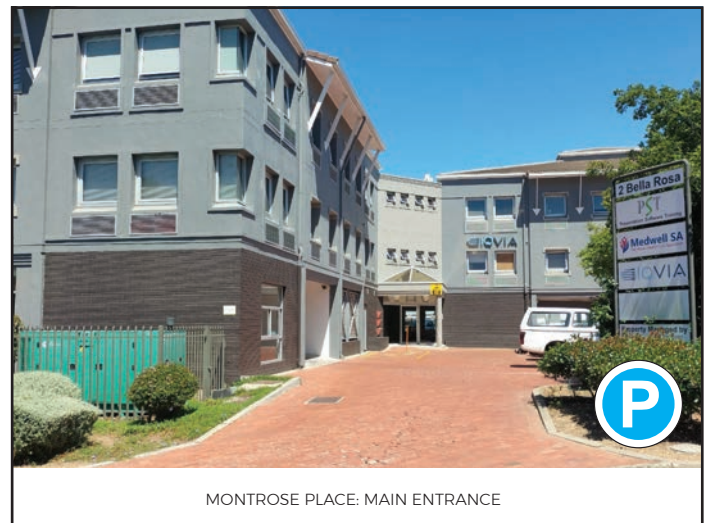
MONTROSE PLACE: MAIN ENTRANCE

PST Training is on the second floor of the Montrose Place building.