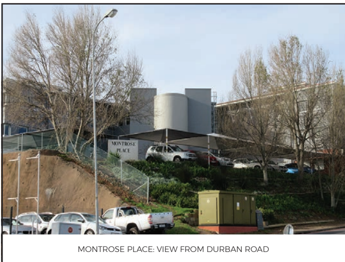
MONTROSE PLACE: VIEW FROM DURBAN ROAD