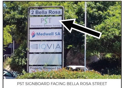
PST SIGNBOARD FACING BELLA ROSA STREET